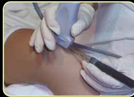
TX MicroTip™ Handpiece with optimized ultrasonic energy simultaneously cuts and removes diseased tissue.